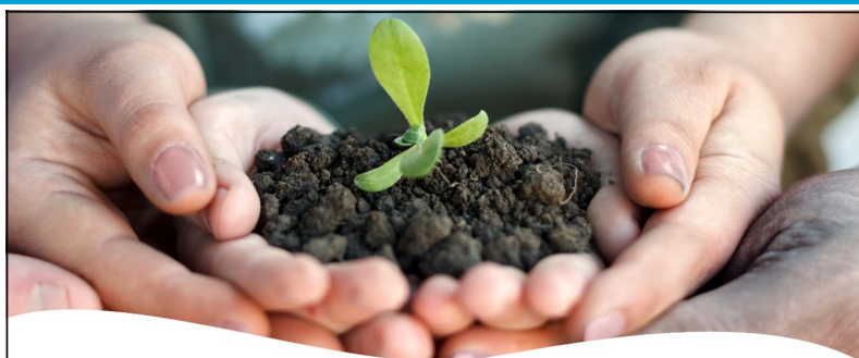
Laudato Si Week 16-24 May 2022

We pray for all young people, called to live life to the fullest; may they see in Mary's life the way to listen, the depth of discernment, the courage that faith generates, and the dedication to service.